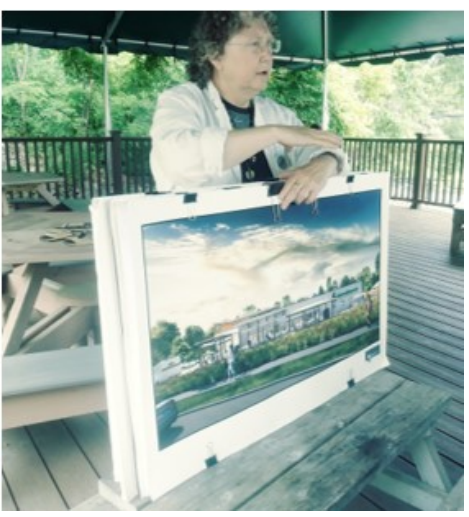
Co-op Tour: Compost Co-op, Real Pickles, Artisan Beverage, PV Squared, Downtown Sounds, River Valley Co-op